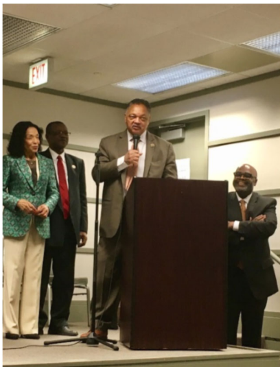
Trailblazer awardees at the Commission’s first inaugural summit