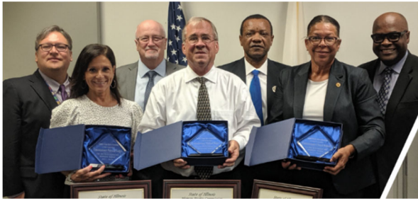
Special Panel Commissioners Commended for their Service

The Commission’s August 2019 projection in last year’s First Progress Report was prescient. In short, the Request for Review backlog was eliminated in 14 months, and well ahead of the December 2019 deadline in Executive Order 2018-08.