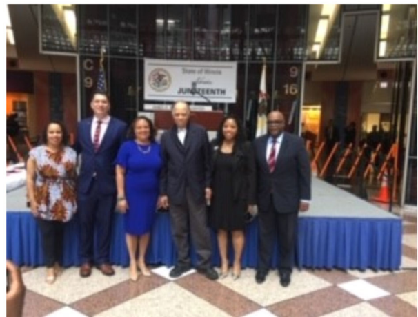
Governor Pritzker’s keynote address and Juneteenth proclamation