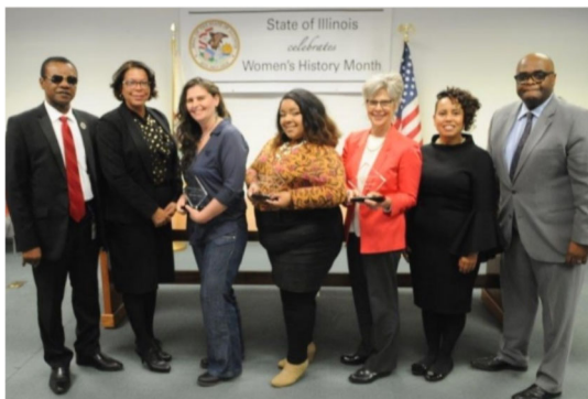
Awardees honored for their community service and activism

In March, the Commission held a Women’s History Month ceremony, during which the Commission awarded its inaugural Diamond Awards to three women for their community service and activism.