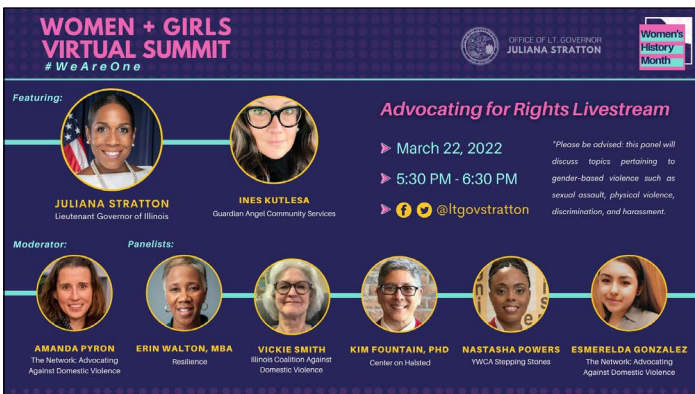
The first installment of the “Know Your Rights” campaign’s virtual series held during Women’s History Month in 2022.