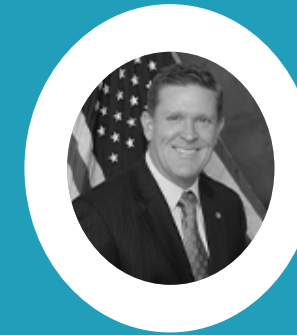
BRENDAN KELLY ILLINOIS STATE POLICE