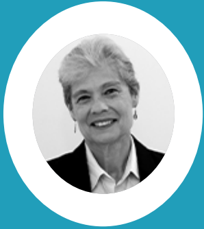
MONA NORIEGA ILLINOIS HUMAN RIGHTS COMMISSION