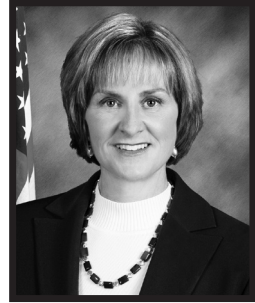
Senator Christine Radogno Senate Republican Leader