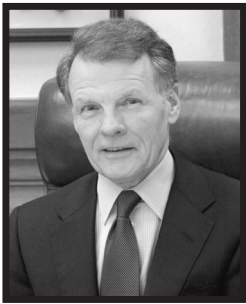
Representative Michael J. Madigan Speaker of the House