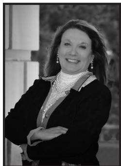
Senator Pamela J. Althoff