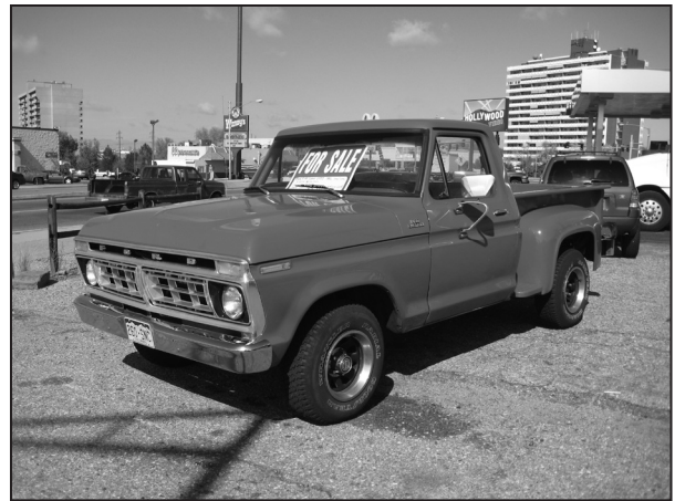
John Lloyd, Wikimedia Commons

Legislators voted to create new “Buy Here, Pay Here” used vehicle dealer licenses, and to require a license for scrapping a salvage vehicle. They also voted to require pharmacy benefit managers to register with the state. Pharmacists with required training will be able to inject long-acting opioid antagonists or antipsychotic medications. The required training courses for public health dental hygienists are specified.